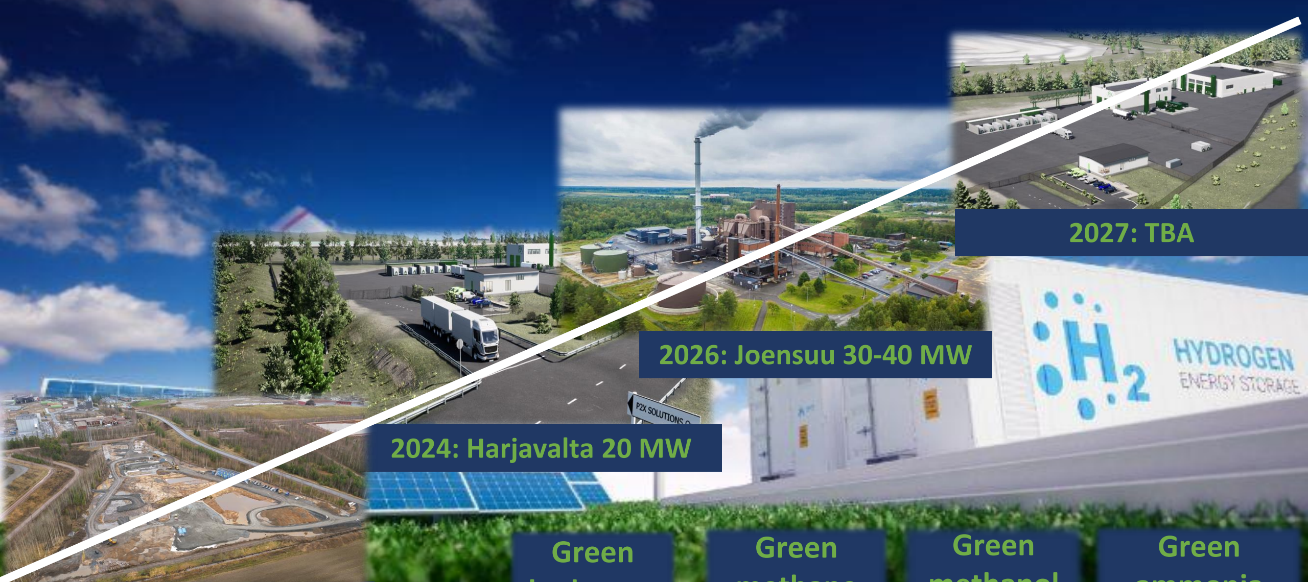
2022: Harjavalta 20 MW